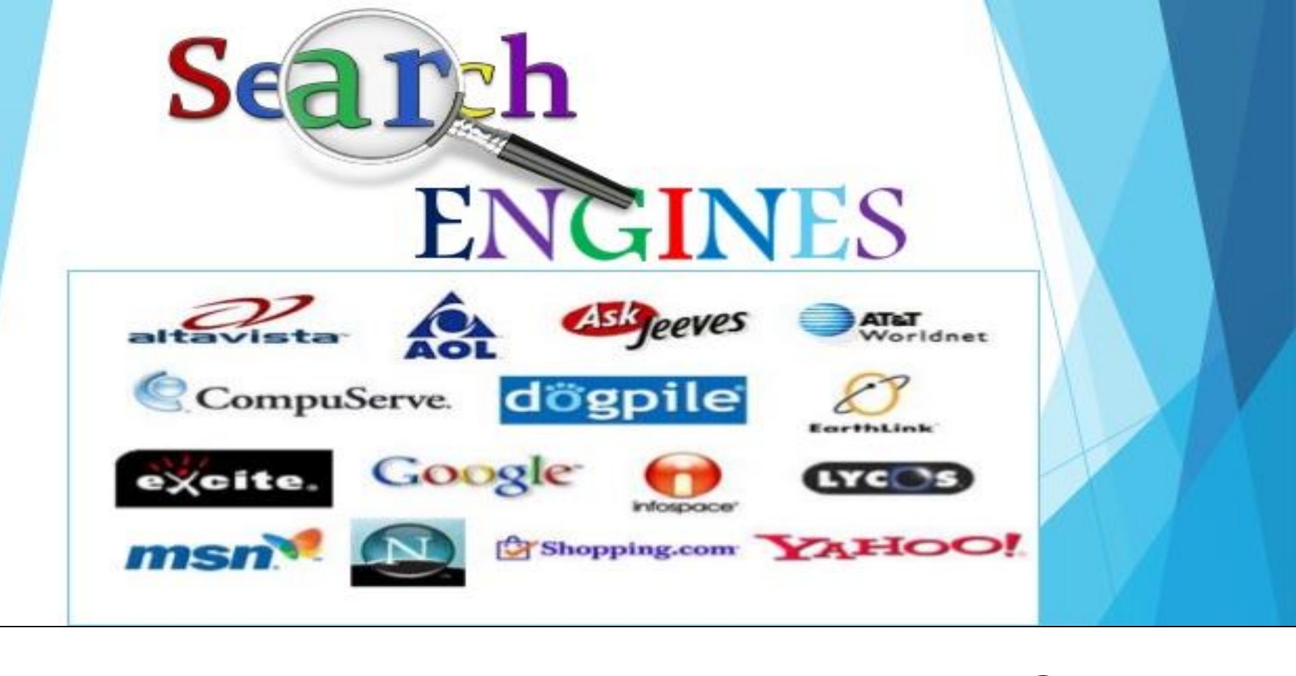
B.Ed 4th Semester